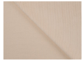
511 off white