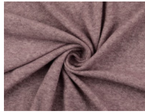
5016 altrosa meliert