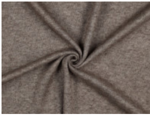
005 taupe melange